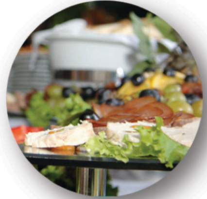
Hors d'oeuvres buffet

Mesquite Smoked Salmon on pumpnickel slice, served with a cucumber dill spread