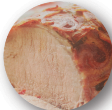
Honey Glazed Pork