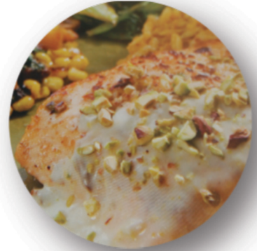
Herb Crusted Salmon with Pecans