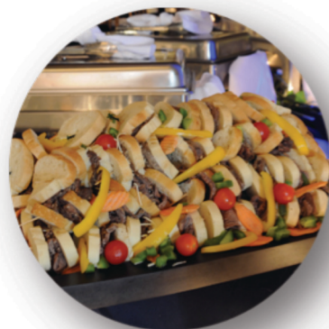
Mini Beef Tenderloin Baguettes